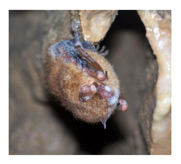
Figure 1. A WNS positive tri-colored bat from Worley's Cave in February 2010.