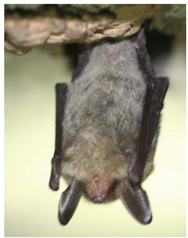
Figure 8. A healthy N. long-eared bat in Tobacco Port Cave in 2009