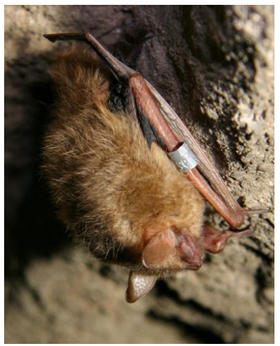
Figure 6. A tri-colored bat banded in Rice Cave in 2010

In addition, the appropriate agency and individuals will respond to any reports from the public of WNS symptoms in caves or the surrounding landscape to assess the reported situation.