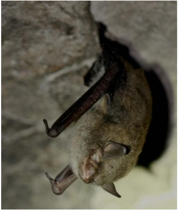
Figure 9. A healthy Indiana bat in Tobacco Port Cave in 2009

WNS-infected and non-infected bats will be banded at these caves and any other documented occurrences. newly Observation of banded bats in years following initial mortality events. combined with additional banding in late spring once a site is found to be affected, could provide conclusive evidence whether some individuals are able to survive exposure to an environment with shared other WNS affected Additionally, the surface individuals. temperature of the cave wall near the roost will be recorded.