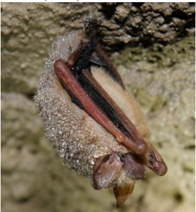
Figure 7. A healthy tri-colored bat in Tobacco Port Cave in 2009

WNS was confirmed in six caves (Table 5, Figure 4) and three species (Figures 7-9) beginning in February of 2010. These caves will be monitored to document the level of mortality in the winter of 2010/2011 (Table 6).