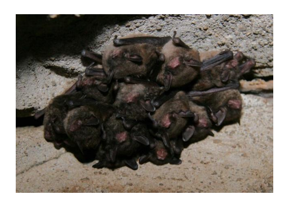
Figure 2. A cluster of Indiana bats in Hubbards Cave in 2009