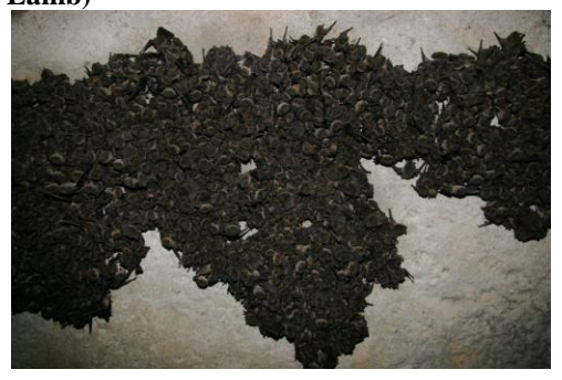
Figure 3. A cluster of gray bats in Hubbards Cave in 2009

All biologists conducting bat surveys in Tennessee adhere to guidance presented in the most recent disinfection protocol from the USFWS (http://www.fws.gov/WhiteNoseSyndrome/). Any equipment used in a WNS positive cave is dedicated to use only in WNS caves.